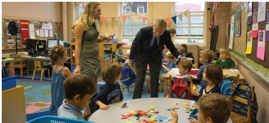
André Vallini, Minister of State for Development and Francophonie, The Monitor School, PS 110, New York, United States (Sept. 2016).